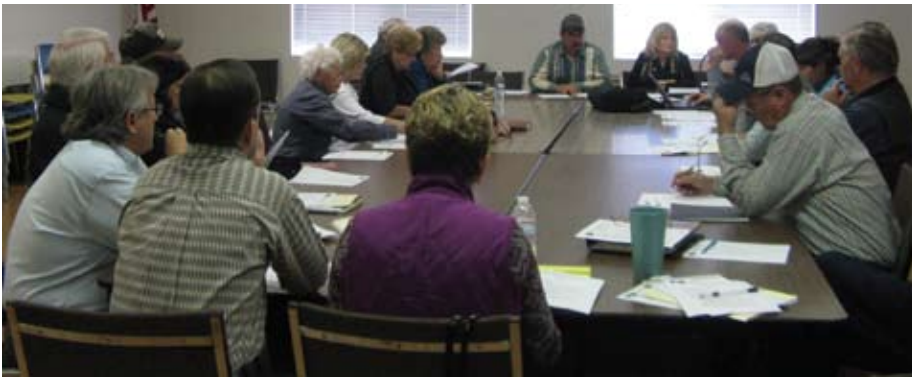
A number of agriculture organizations held meetings at Farm Bureau to discuss the ordinances.