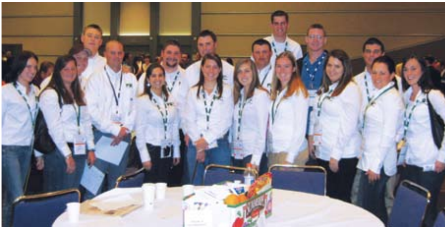
SLO County Young Farmers & Ranchers attended the National YF&R Leadership Conference in February 2009.